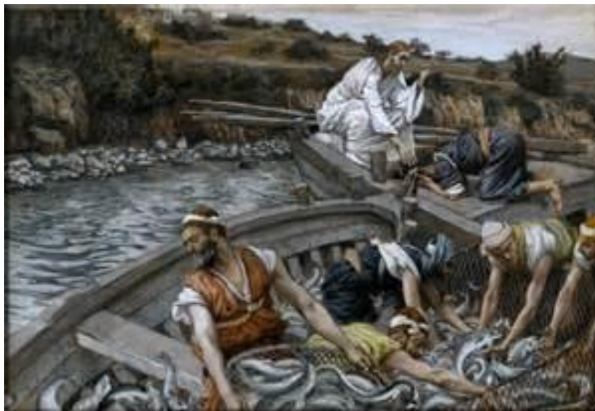
13 th Sunday in Ordinary Time.

DOMINUS illuminatio mea, et salus mea, quem timébo? Dóminus defénsor vitæ meæ, a quo trepidábo? Qui tríbulant me inimíci mei, ipsi infirmáti sunt, et cecidérunt.