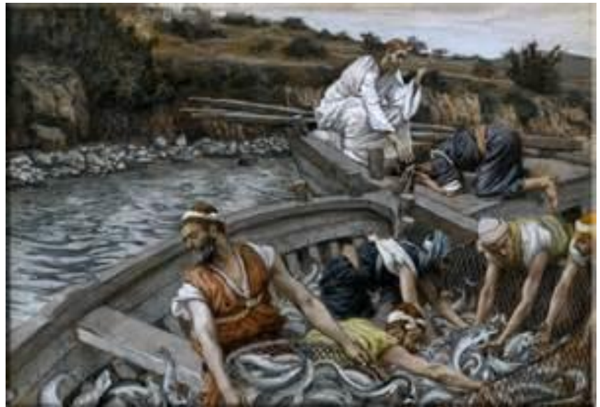
13 th Sunday in Ordinary Time.

DOMINUS illuminatio mea, et salus mea, quem timébo? Dóminus defénsor vitæ meæ, a quo trepidábo? Qui tríbulant me inimíci mei, ipsi infirmáti sunt, et cecidérunt.